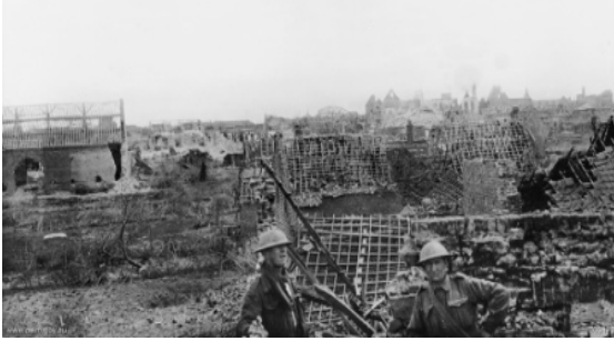
Shattered buildings in the French village of Lagnicourt, which was captured by the Australians in late March 1917 as the Germans withdrew towards the Hindenburg Line. The Germans heavily shelled the village as they retreated.

The Australian War Memorial website notes that the 58th Battalion was raised in Egypt on 17 February 1916 as part of the expansion of the AIF. Roughly half of its recruits were Gallipoli veterans from the 6th Battalion and the other half were fresh reinforcements from Australia. Reflecting the composition of the 6th, the 58th was predominantly composed of men from Victoria. The Battalion became part of the 15th Brigade of the 5th Australian Division.